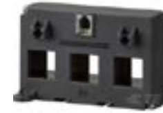
CURRENT TRANSFORMERS AND SHUNTS