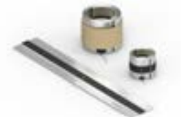
DUCT SEALING SYSTEM