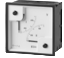
ANALOG POWER INSTRUMENTATION