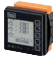
ELECTRONIC POWER INSTRUMENTATION

Our portfolio of Crompton offer electrical measurement capability - from power generation to energy consumption across the industrial supply chain.