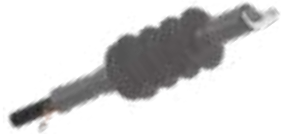
COLD SHRINK TERMINATIONS UP TO 52 kV

Our Raychem heat shrink, cold shrink and dry type terminations handle long-term electrical stress. Easy to install with high-reliability thanks to our material science.