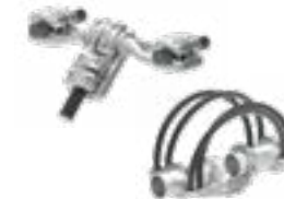
HIGH VOLTAGE MODULAR SUBSTATION CONNECTORS