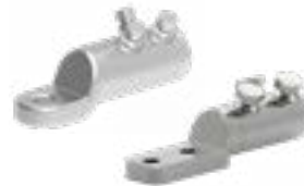
SHEAR BOLT CONNECTORS

Compact and easy to install, we have a wide range of cable cleats and shear bolt connectors to reduce your stock levels.